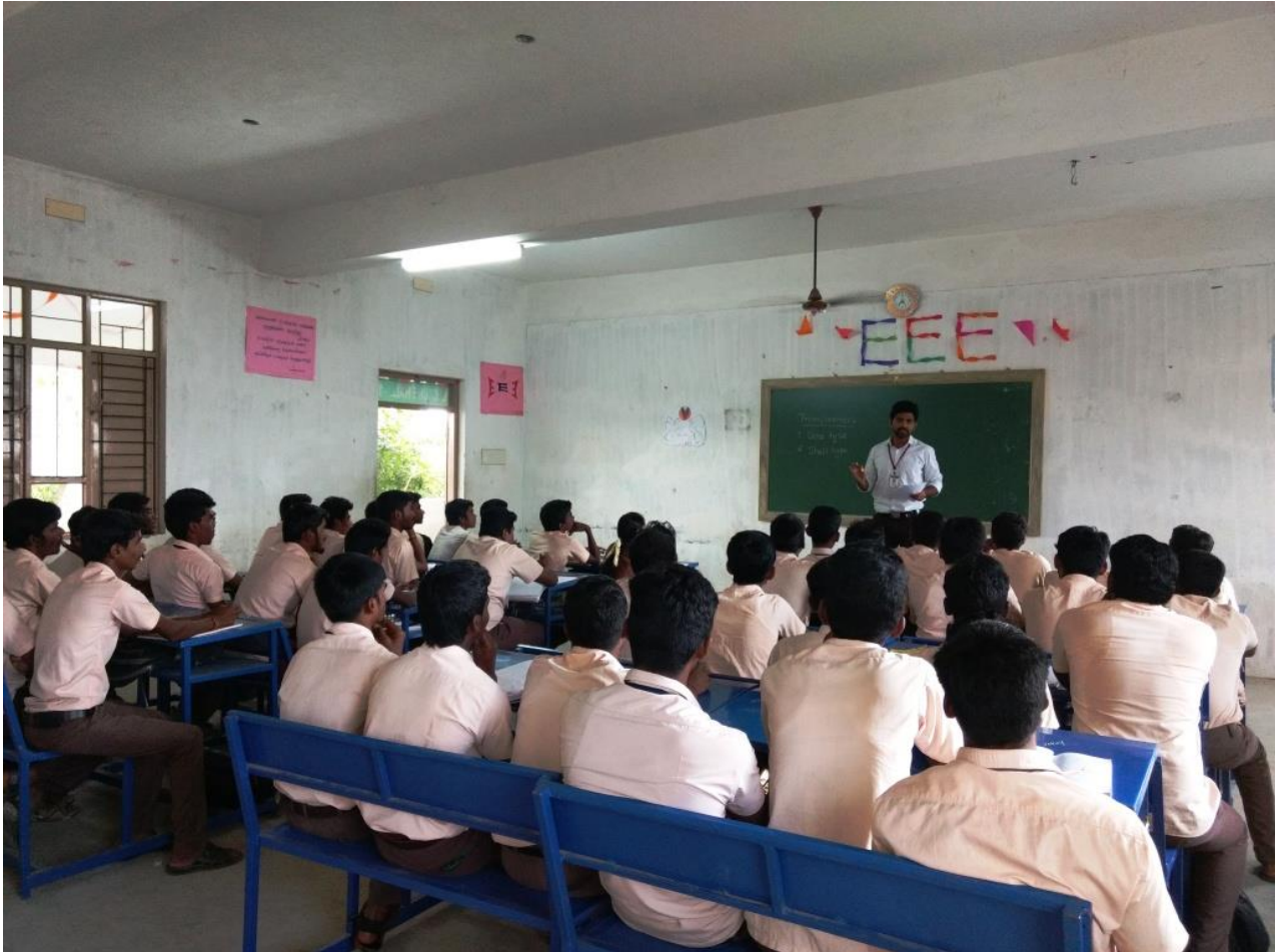
Classroom/Tutorial Room Facilities